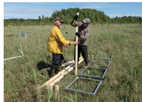
Installation of chambers for the measurement of greenhouse gases in the predecessor project LIFE Peat Restore.