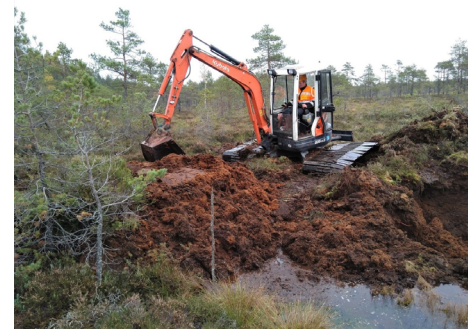
This is how peatland restoration measures can look like: In the predecessor project LIFE Peat Restore, dams were built in the Latvian mire Augstroze Nature Reserve.

Rewetting helps to restore the natural functions of peatlands. Raising water levels in peatlands immediately reduces GHG emissions and, in the long term, also helps to restore the peatlands’ function of accumulating organic carbon. By rewetting degraded peatlands in five countries, the LIFE Multi Peat project now aims to convert an urgent climate crisis into a sustainable pathway to the future.