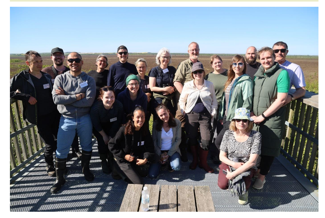
Combining forces to increase the impact of peatland communication - The LIFE PeatCarbon partners together in Denmark during a visit at Lile Vilmose.